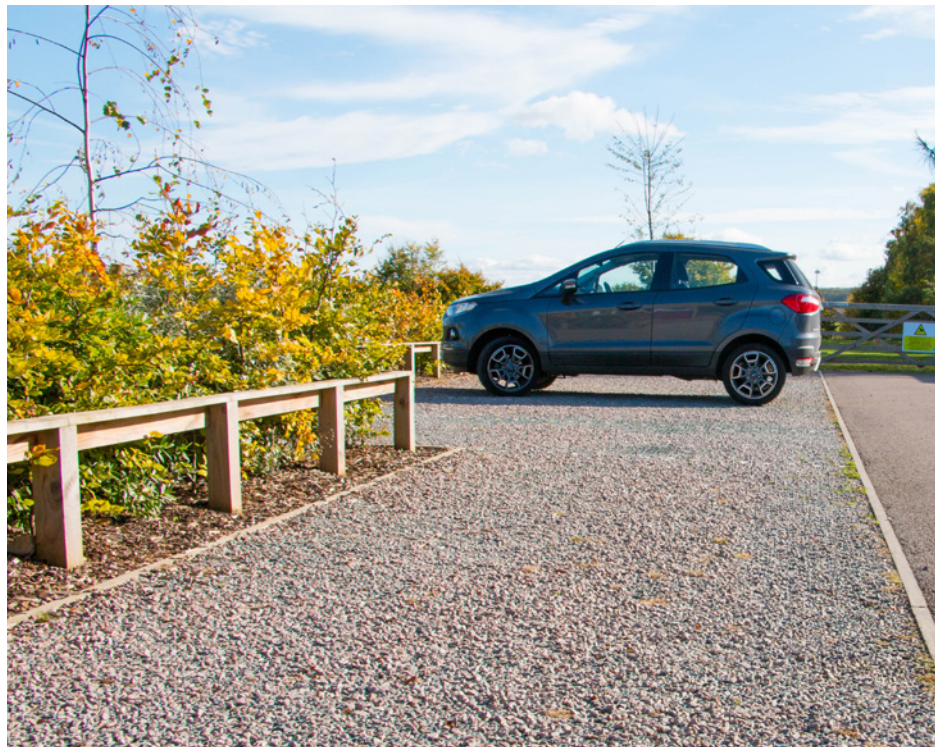
Quick and professional installation with ACO GroundGuard