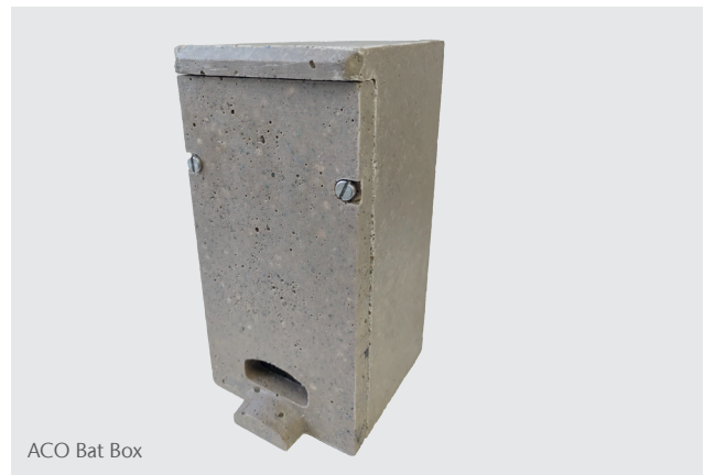
ACO Bat Box

The front panel is removable for inspection and cleaning. This should only be done by a suitably licensed person and when it is clear that the box is not being used.