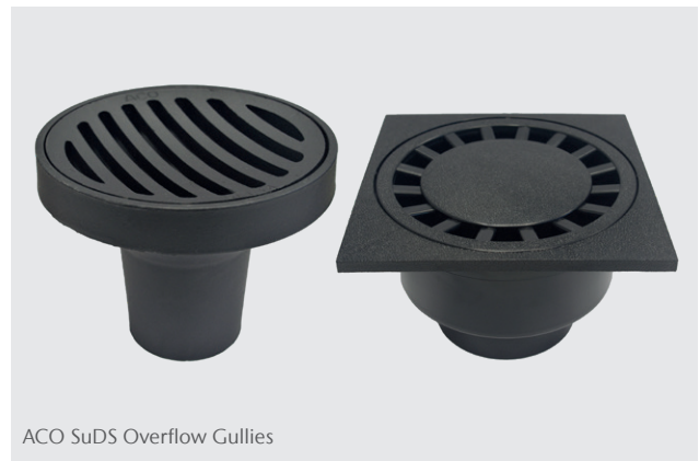
ACO SuDS Overflow Gullies